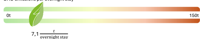
GHG emissions per overnight stay

Accounting period: 01/01/2025 to 31/12/2025